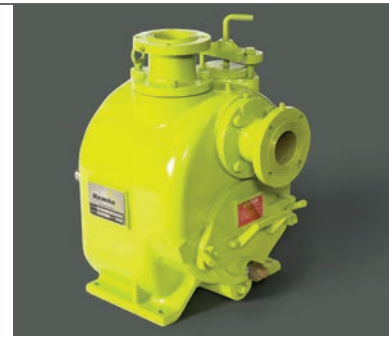
The Remko RT050 Trash Pump

RT Series Pumps are ideally suited for industrial applications including: steel and paper mills, abattoirs, mines, food and chemical processing plants, construction industry, dewatering, trade waste and sewage handling.